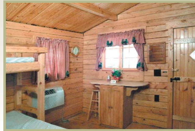
An interior view of one of our one room rental cabins.

Our camping log cabins are available with either one or two rooms, each including a dorm sized refrigerator, microwave oven, heat and air conditioning. Two room cabins feature a separate bedroom and a living room / dinette area. There are no kitchens or bathrooms in our cabins. Our travel trailers offer true camping luxury, with 27', 30' and 35' options, some including slide-outs. Each trailer comes complete with a fully equipped kitchen, full bathroom, a combination VCR / TV, a master bedroom with a queen sized bed, and a separate bunk bed sleeping area. With either cabins or trailers, you provide your own bedding and linens.